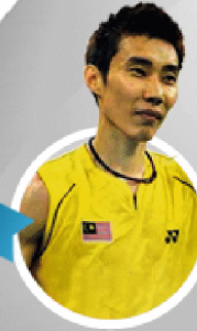
Lee Chong Wei